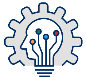
Technology & Innovation