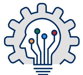
Technology & Innovation