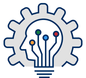
Technology & Innovation